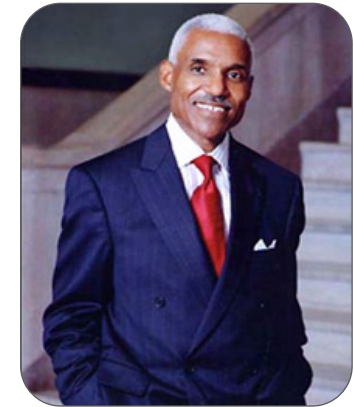
SHELBY COUNTY MAYOR AC WHARTON